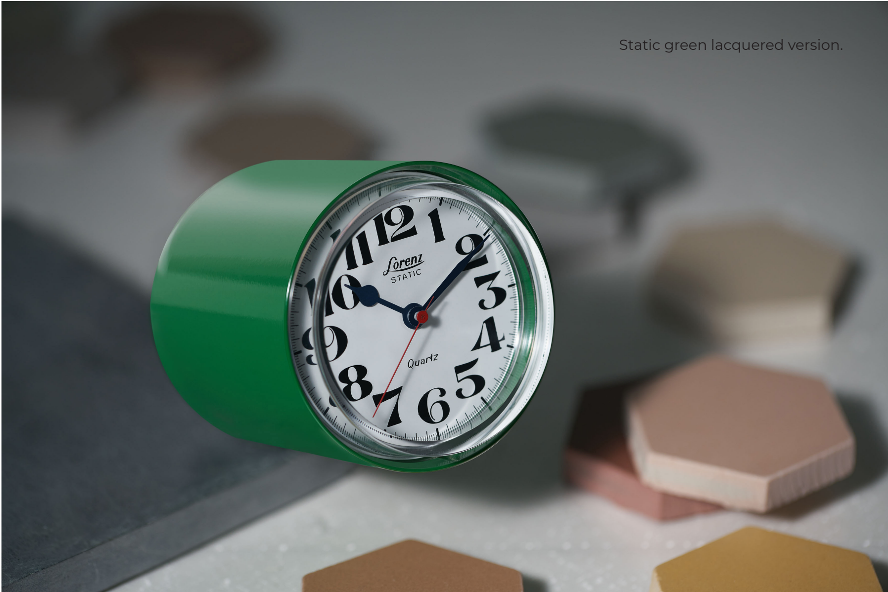
438GR Green color with white dial. Ean code: 8013280107736. 439€