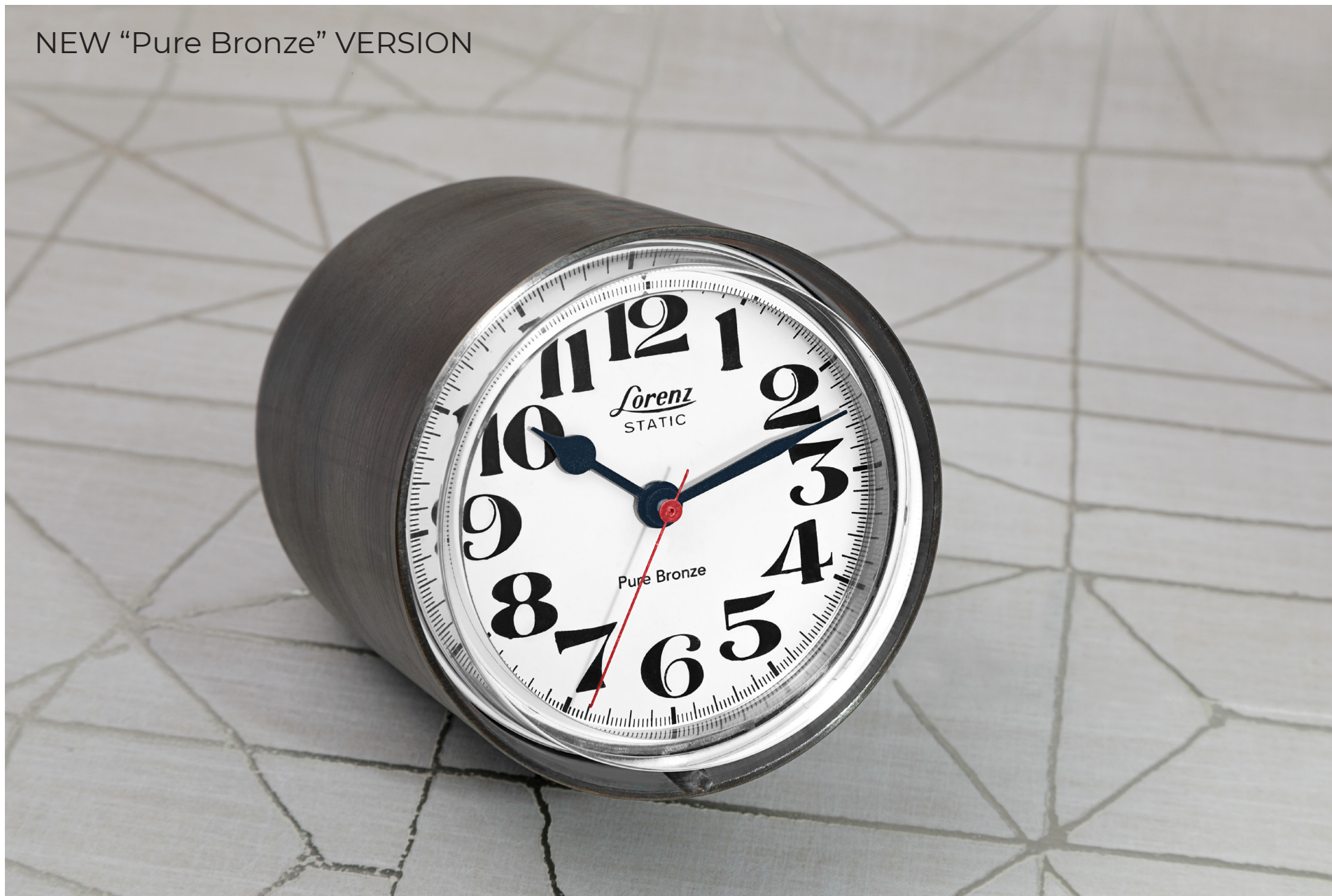
438BR (solid bronze), 890€, weight 1,500 gr.